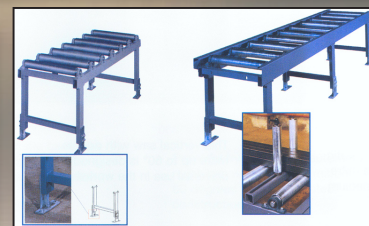
Roller Tables & Stands